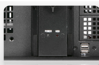
Power button HDD LED Indicators 2x USB 2.0